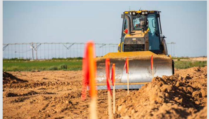
ROAD CONSTRUCTION - MATERIAL LAYERING