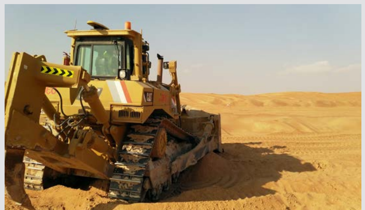
MINING - PASS-2-PASS GUIDANCE