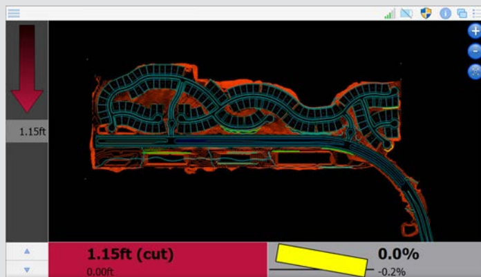
Supports large DTM's