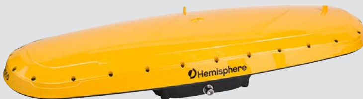
VR500 GNSS RTK Smart Antenna

Grademetrix is designed with support for the VR1000 and VR500 GNSS RTK heading receivers. Both receivers, with their integrated UHF radio, require a single cable connection to the IronTwo display. Multiple decades of experience merging GNSS technology with precision applications provides a simplified installation and calibration procedure.