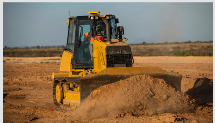
SITE PREPARATION - COARSE GRADING